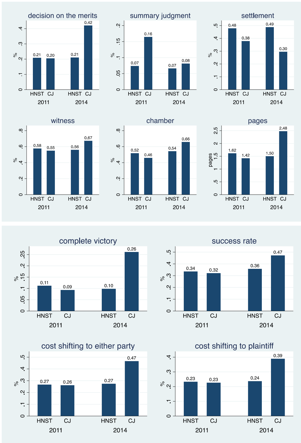
Figure 2 Descriptive Statistics for definition of dependent variables see Table 1 scale: % for whom dummy is 1; number of pages HNST: unaffected districts (Haifa, North, South, Tel-Aviv) CJ: affected districts (Central, Jerusalem)